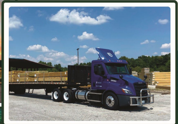
FORTRESS WOOD PRODUCTS