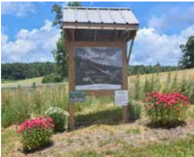
Kiosks along the trail serve to introduce hikers to the history, the wildlife, and the fauna of Meadows of Dan