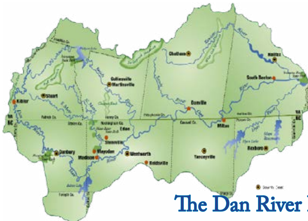
The Dan River Basin