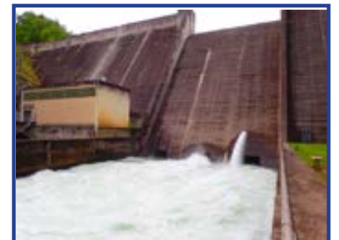
Philpott Dam has returned to generation status following a fire in the powerhouse March, 2016