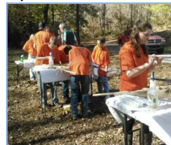
Students work to count macroinvertebrates in the Mayo River