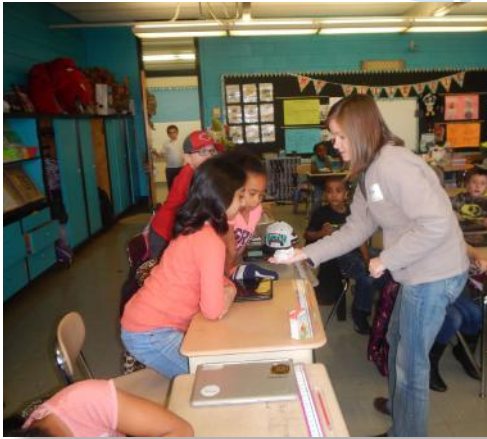
Draper Elementary students are excited to meet their new trout!

In the spring, students release their trout into the Smith River, where they see the river ecosystem first-hand. Here the students make the connection with what they have learned during the school year.