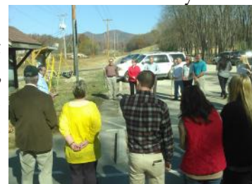
Local trail enthusiasts attend the dedication of the MRRT Phase II completion

The second segment crosses Commerce Street, winds up a gentle slope on the property of Blue Ridge Therapy Connection, stopping at a kiosk. From this point, Phase III will eventually cross Woodland Drive and Stuart Rotary Field to again parallel the Mayo River.