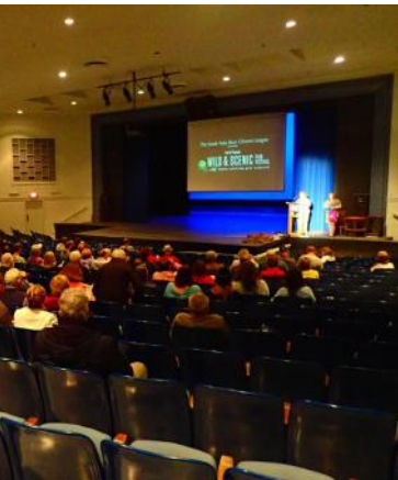
The crowd eagerly waits for films to begin in Pritchett Auditorium.

and Pittsylvania County region stated that “In today’s busy world, it is easy to disconnect from our role in the global ecosystem. When we realize that the change we need in this world begins with us, we start making a difference. DRBA offers so many ways to make a positive difference.”