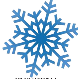
Tanyard Branch Hike