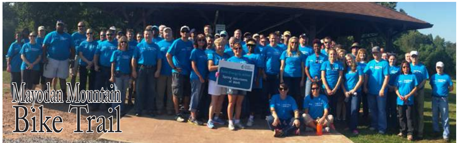
Duke Energy volunteers from across North Carolina helped finish the three-mile Mayodan Mountain Bike Trail at Farris Memorial Park in August.

Volunteers completed the vital hand work on the trail, improving the trail surface, building rock beds, and ensuring for water management on the trail. They also built a kiosk.