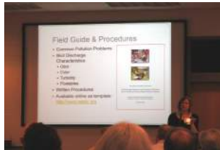
Volunteers attend VWMC Conference

“Exploring Emerging Water Issues” was the theme of the November Virginia Water Monitoring Council (VWMC) Conference in Henrico, VA. After a keynote address on nutrient reduction