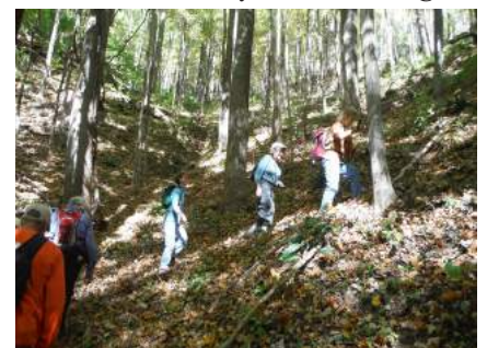
Hikers climb the steep grade to the Pinnacles

Only a mile each way, the trail to the peak rises nearly 900 feet. After we passed through thick brush and open woods, rock outcrops led upward. From the rounded, wooded summit, spectacular views ranged up to vibrant blue sky, down along the