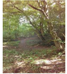
Lauren Mtn. Trail