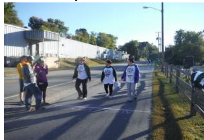
The home stretch at the Apple Dumpling 5K