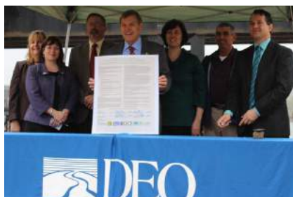
DEQ joins local forces for another year

organizations and reaffirmation of their for supporting and