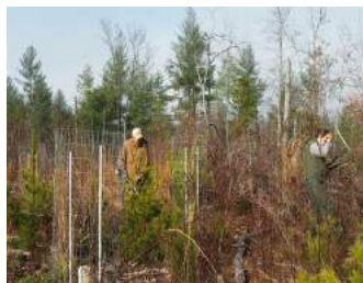
Volunteers work among the Chestnut saplings

15/16 American Chestnut and 1/16 fungus-resistant Chestnut. The goal is re-establishment of this former king of the Appalachian forest. Of 100 saplings planted last spring, 57 are alive. Re-