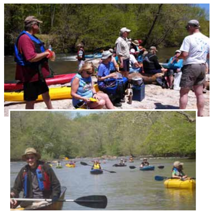
Boaters on the Smith

Upon entering the Smith River, we noticed the Gravely