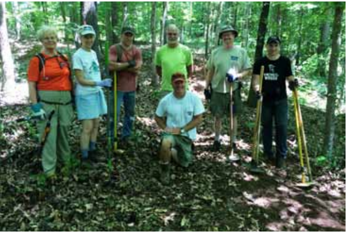
DRBA volunteers learn mountain bike trail-building from experts at Farris Park.

This project is made possible by the Town of Mayodan,