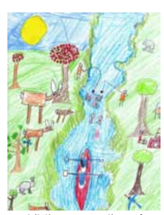
A child's perspective of the Dan

Art and Poetry Exhibits: As the first phase of DRBA's "river awareness" campaign, school children in Caswell County submitted twenty-eight art pieces and twenty poems based on the theme, "Dan River and Caswell County Trails." In addition to being featured in the Caswell Messenger, the artwork and poetry will become a travelling display, building up to a River Days festival in 2012.