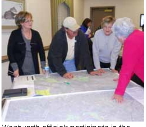
Wentworth officials participate in the trail workshop

values quality of life and has a vision for the future. Moreover, miles of rail trail $500,000 yield average annual benefit to local economy, and homes near recreational trails are more valuable than