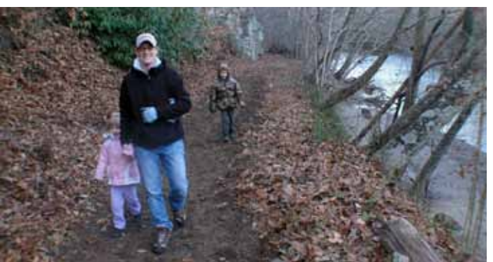
Above: Hikers enjoying the fall and winter lanscapes along the Dan River.