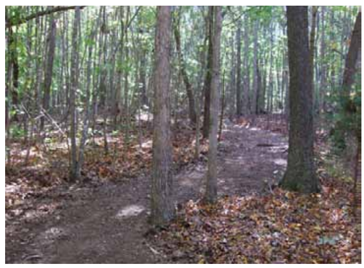
A new trail is born.

Caswell County Heritage Driving Tour: Over 20 "not-to-miss" sites and scenes across Caswell County comprise the driving tour, now in its final design stage. This spring, come