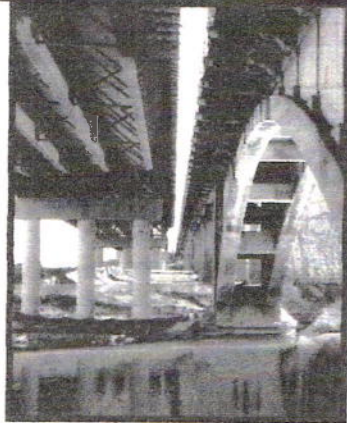
View of construction at Old 87 Bridge south of Eden at 2003 years end.